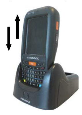
Figure 2 - Mobile Computer Insertion

For correct insertion into the cradle, insert the mobile computer from the top of the cradle and push it down until the clip of the cradle clicks.